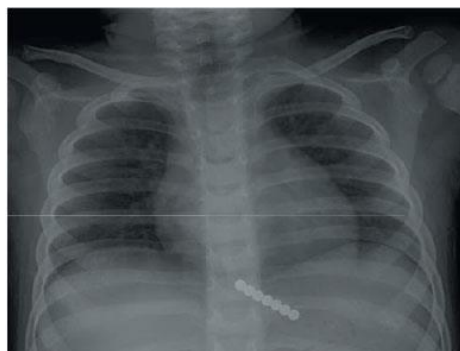
Figure 2: X-ray image of a 3-year-old child with a set of magnets lodged in his gastro-intestinal tract.

Consider the film x-ray image shown below (Figure 2) taken of a 3-year-old boy in the ER showing seven magnets lodged in his lower esophagus and upper stomach. The upper two magnets are in the esophagus while the remaining lower five are in the upper stomach.