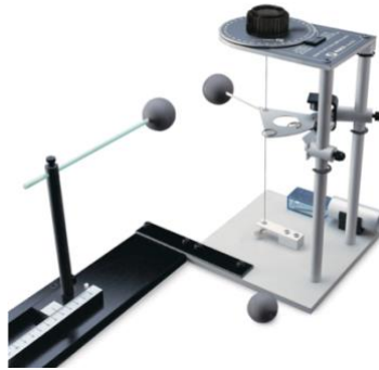
Figure 1.1: The Coulomb Balance apparatus ( https://www.pasco.com )

In this experiment you will attempt to determine the experimental form of the electrostatic force law, or Coulomb's law. You will use the apparatus in Figure 1.1 to determine the experimental relationship between the electrostatic force and the separation between the two charged spheres. Then you will use this relationship to determine the charge Q placed on a sphere.