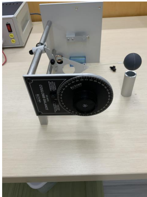
Figure 1.2: Torsion balance laid on its side with the slide assembly removed.