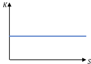
Figure 6.2: A plot of the kinetic energy of an ejected electron as a function of the intensity of light incident on a metal surface.