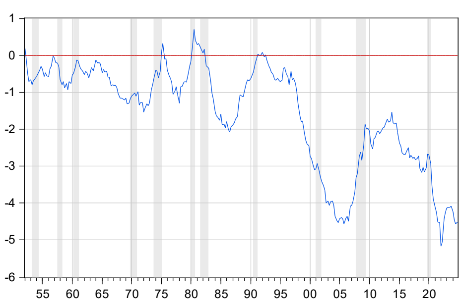
U.S. Net International Investment Position as Percentage of GDP